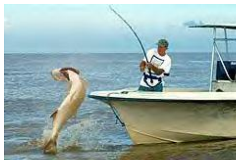
The Silver King