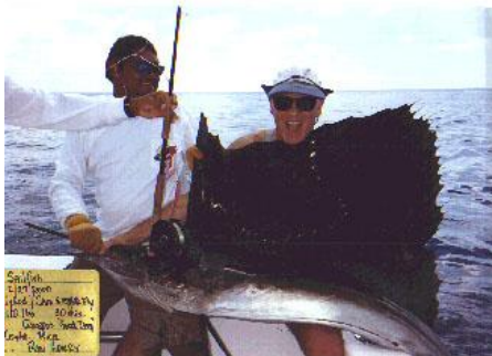
Trophy Sails in Costa Rica