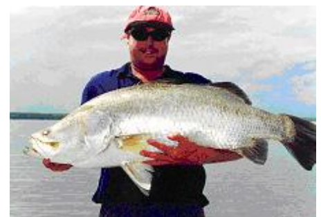
Barramundi Down Under

Email us at peacockbassadventures@hotmail.com or call us at 678-327-6787 to discuss your angling travel needs throughout the globe.